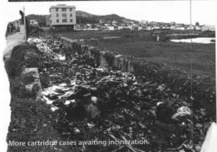
More cartridge cases awaiting incineration.