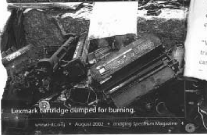
Lexmark cartridge dumped for burning.

www.hic.org • August 2002 • Imaging Spectrum Magazine 4